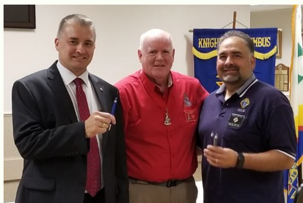
Thank You letter and gift of VIP PEN from Director Texas State Council